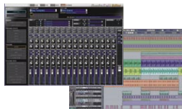
■ Plug-in editor and SONAR LE screens

Bundled with Cakewalk SONAR LE, SonicCell lets you dive into serious music composition from day one, while the supplied plug-in editor (compatible with both Windows VSTi and Mac OS AudioUnits) allows SonicCell's 16 parts to be displayed with total recall on a computer display. Naturally, the sound production and processing muscle is provided by SonicCell, which removes the processor strain on your computer.