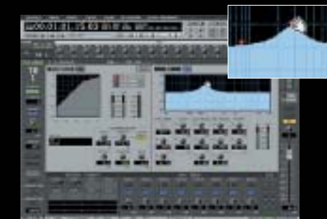
•External VGA Display Example (Channel View)

24 TR / 24-bit / 96 kHz DIGITAL STUDIO WORKSTATION