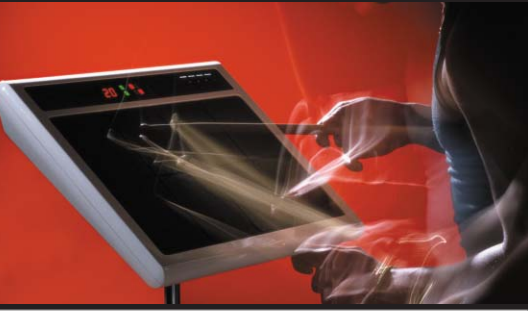
SPD-20 TOTAL PERCUSSION PAD