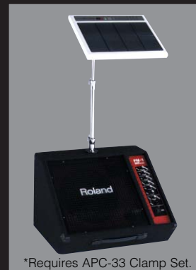
*Requires APC-33 Clamp Set.

The PM-1 is the perfect monitoring system for Roland's SPD-Series and HPD-15 HandSonic. Precisely tuned for the needs of acoustic and electronic percussionists, the PM-1's 60-watt amplifier and 2-way speaker system sound great on stage or at home. And monitoring is easy, thanks to a smart angled design that even accommodates drum stands.