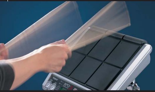
SPD-S SAMPLING PAD