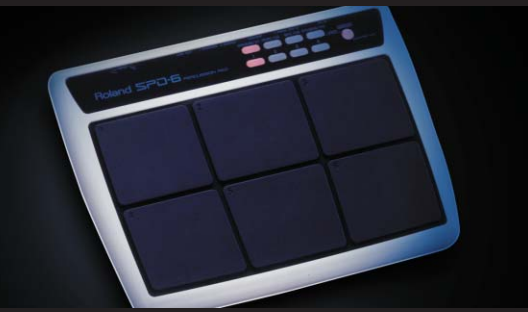
SPD-6 PERCUSSION PAD