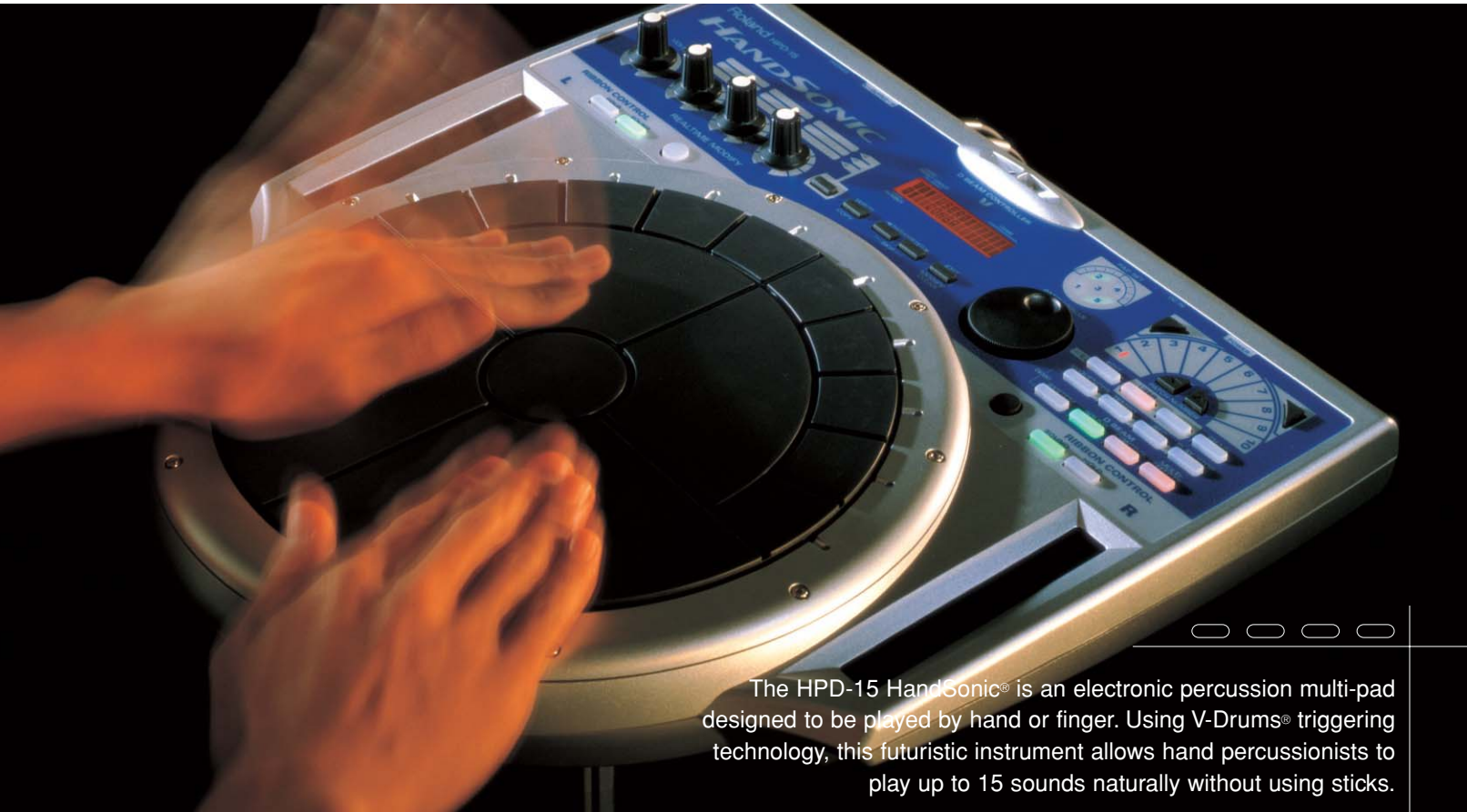
The HPD-15 HandSonic® is an electronic percussion multi-pad designed to be played by hand or finger. Using V-Drums® triggering technology, this futuristic instrument allows hand percussionists to play up to 15 sounds naturally without using sticks.