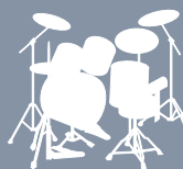
Acoustic Drum Set + RT-7K / RT-5S / RT-3T