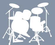
Acoustic Drum Set + RT-7K / RT-5S / RT-3T