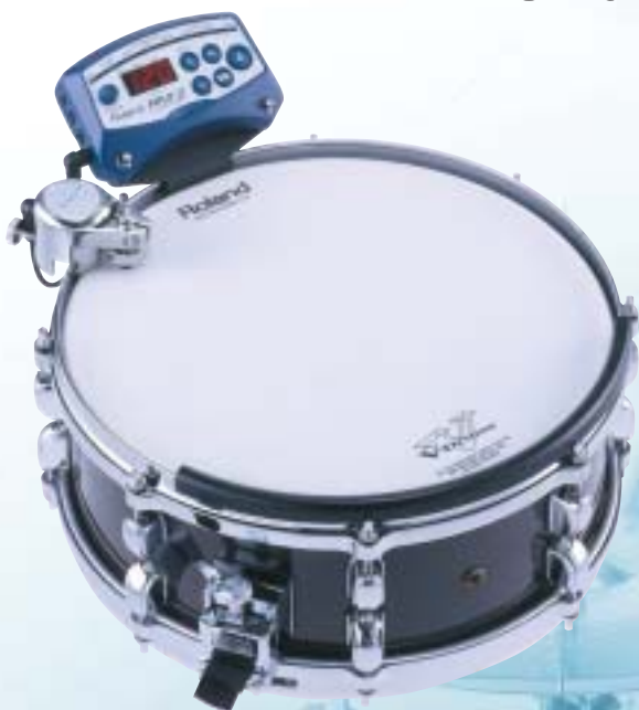
*RM-2 and Snare Drum not included.

With the PCK-1 Practice Conversion Kit, you can turn your acoustic snare drum into a near-silent practice pad. This special package includes a patented 14-inch mesh head, an acoustic trigger with separate head/rim capabilities, and a rim silencer so you can practice naturally without disturbing others. Add an optional RM-2 Rhythm Coach training module for even more effective practice.