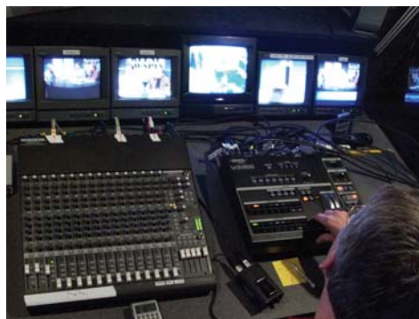
Monitors are connected to the preview outputs on the LVS-800.