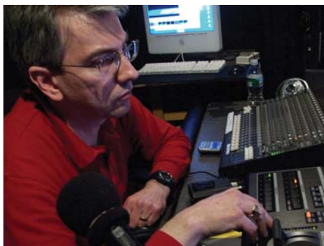
The iMac supplies graphics, text and lower thirds to the LVS-800.

"After 3 months of using the EDIROL LVS-800 switcher, we're thrilled," notes Perkins. "We can't wait to get another one for our portable field kit. Nothing else compares at this price point. Overall, this was a fantastic option for us."